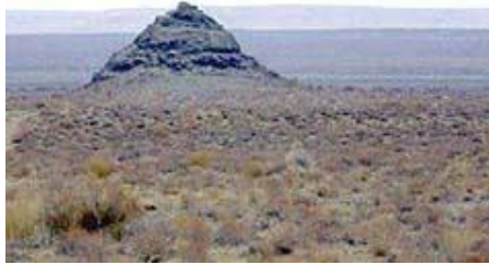
Ancient burial ground "Hazor Nur" ("A Thousand Rays"), which is over 1,000 years - the burial place of the first Muslims in Uzbekistan