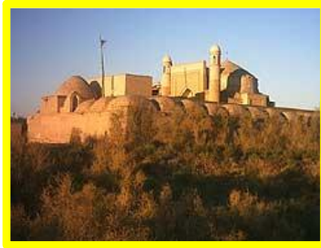
Women's Sufi monastery Kiz Bibi