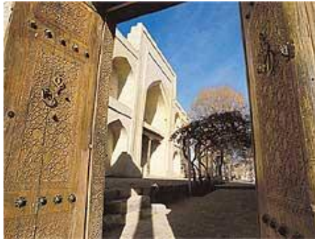
Complex Baja ad Din Naqshband in the village of Kasr-Orifon ("Lock, know the divine truth")