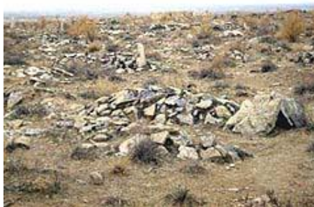
Here, instead of people, the vast field covered with small tubercles of stacked boulders.