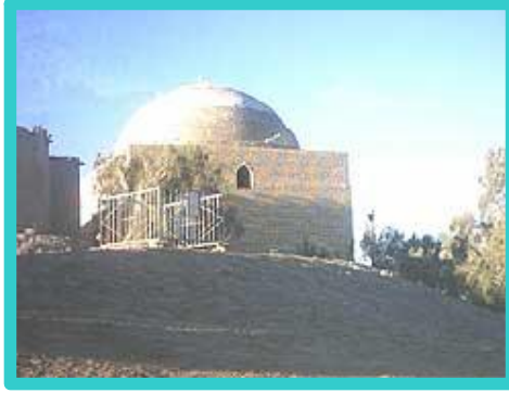
Mazar Ubbona Hodge. Surrounded by century-old Haloxylon, a desert region, dumping Ubbona Hodge, revered as a saint.