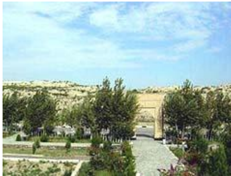
Garden around the burial Khoja Muhammad Boba Samos