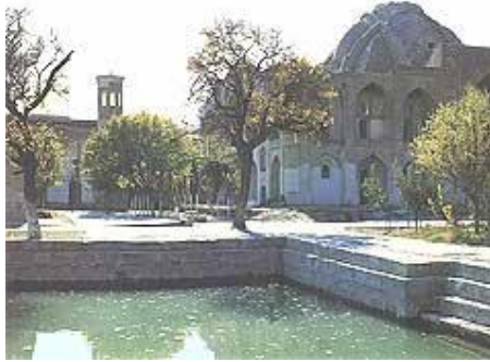
Complex Baja ad Din Naqshband at burial of the founder of the Sufi Order "Naqshbandi".