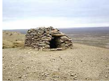
Hazor Nur - a place of pilgrimage