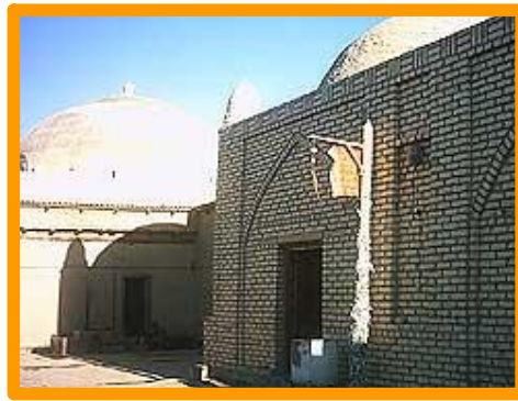
Sacred spring next to the tomb of Khoja Ubbona.