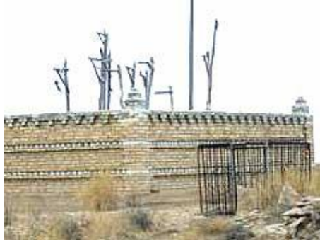
12 Tugov (wooden pommel, ustanavlinaemoe over the tomb of Sufi) from disposal of the inhabitants of Hazor Nur