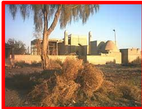
Women's Sufi monastery Keyes Bibi (16th century)