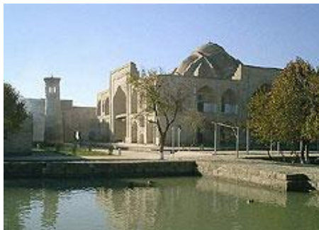
Complex Baja ad Din Naqshband. Honako Abdulla, a pond with a sacred tree on the shore. The minaret of the 19th century.